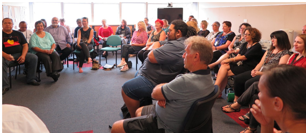
A large number of representatives of mental health providers and tangata whaiora met in early March 2018 to discuss the process going forward to co-design a new model of care for mental health and addictions services in the Lakes district.

An initial business case was developed that went to the Lakes DHB Board in December 2017 to get