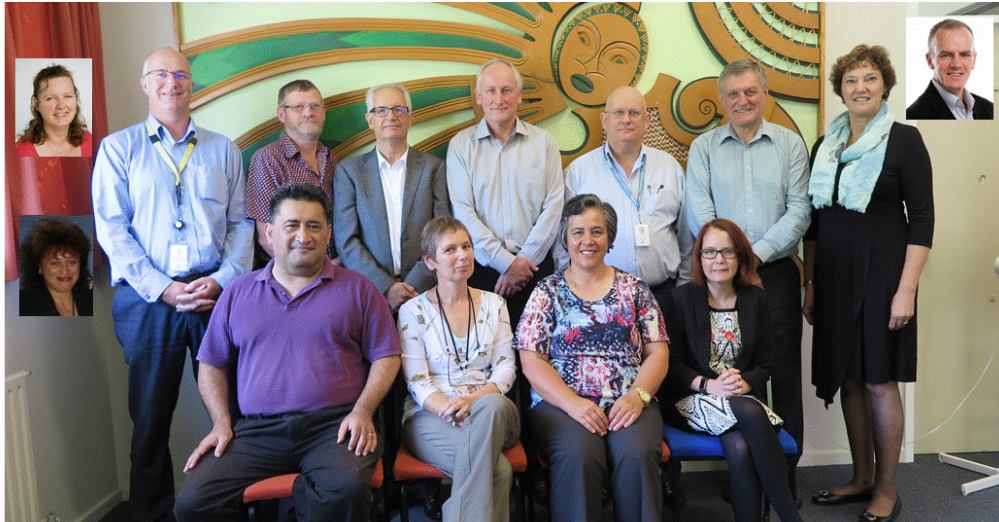
MAURI ORA Governance Group